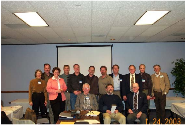
Past AEG-RMS Section Chairs, January 24, 2003 RMS Section Meeting